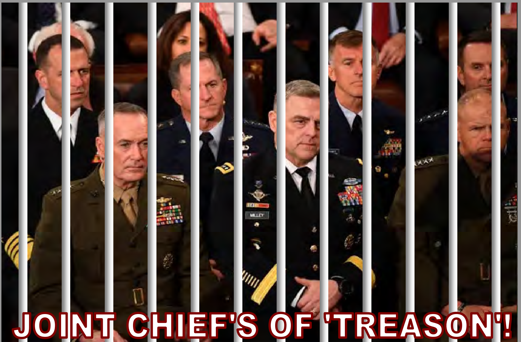
JOINT CHIEF'S OF 'TREASON'!