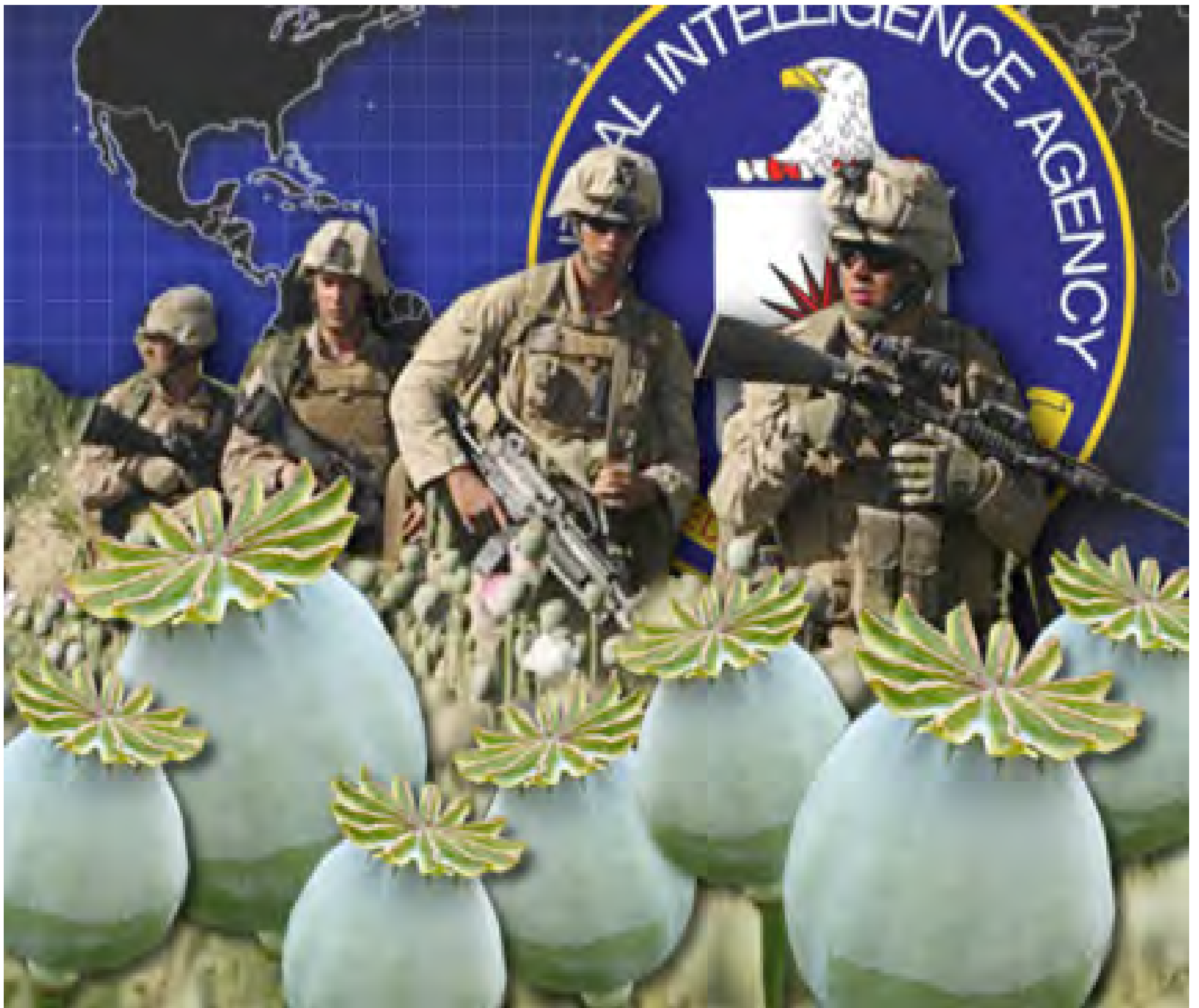
U.S. FORCES PROTECTING THE CIA'S AFGHANISTAN OPIUM FIELDS