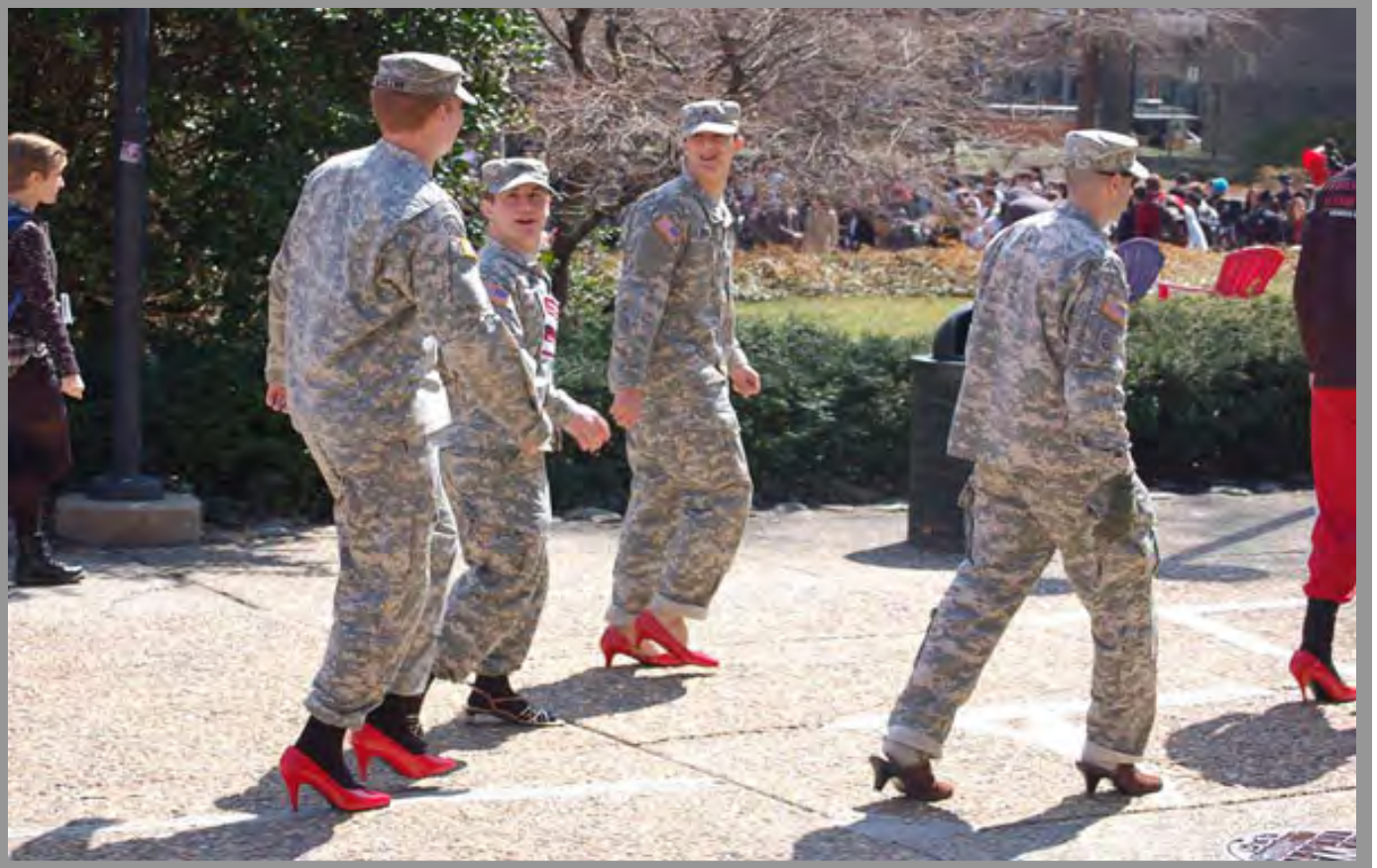
TROOPS MARCHING AROUND IN HIGH-HEELS