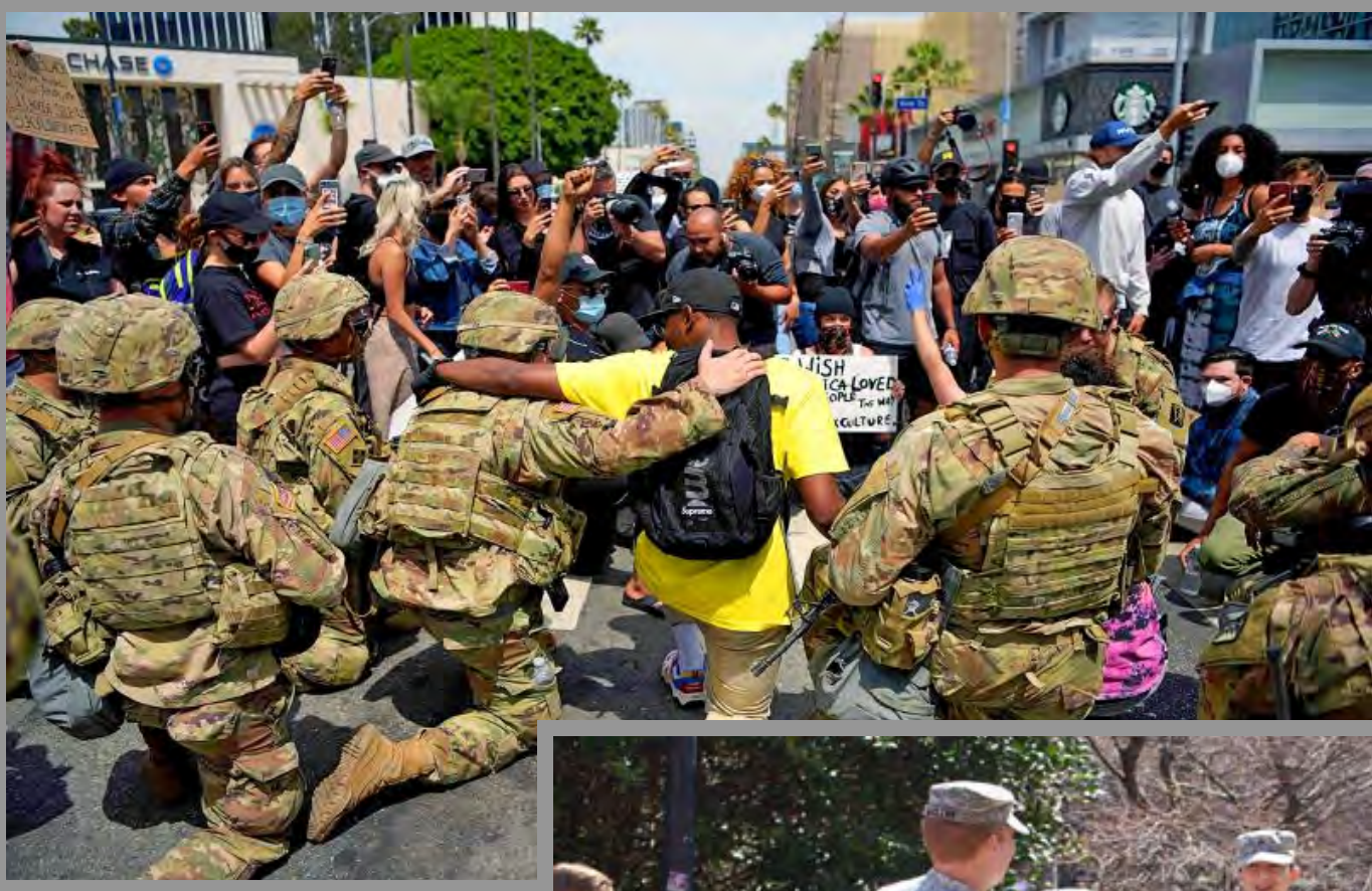
TROOPS KNEELING BEFORE THE TERRORIST ORGANIZATION BLM